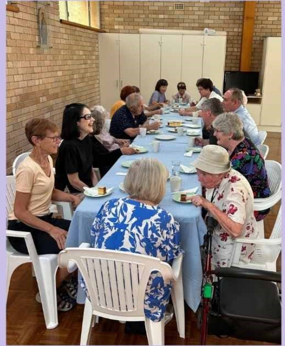
Right: Morning tea in St Joseph's Hall following the monthly Healing Mass last Friday week.