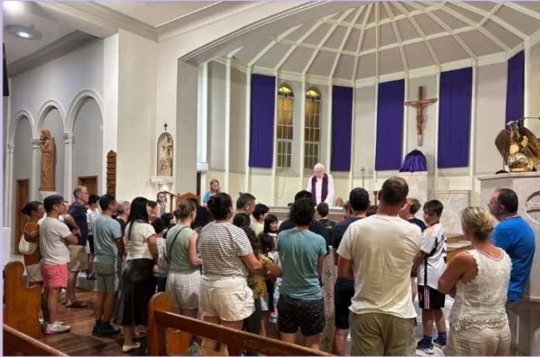
Above: The Rite of Peace, part of the preparation for First Reconciliation, at last Sunday night's Mass.